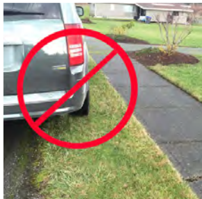
Be considerate of your neighbors: park right