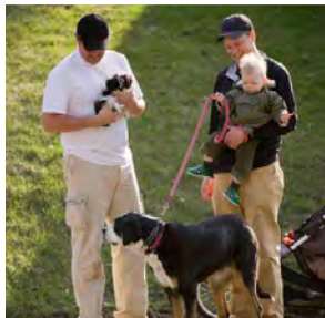
Clean up after "Fido" at home and in community