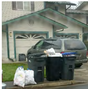
Avoid being charged for someone else's trash