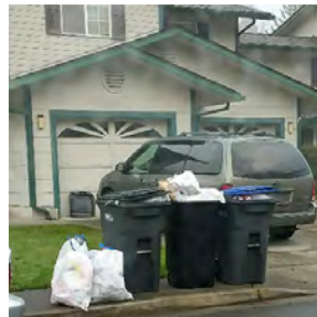
Avoid being charged for someone else's trash