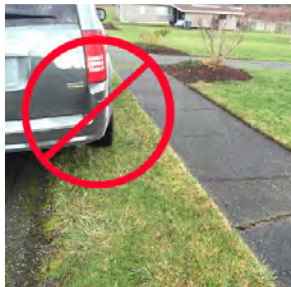
Be considerate of your neighbors: park right