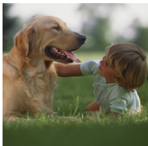
Clean up after "Fido" at home and in community