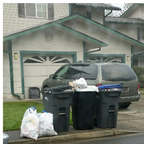
Avoid being charged for someone else's trash