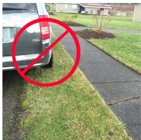
Be considerate of your neighbors: park right