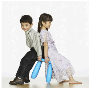
PLEASE PARK PROPERLY