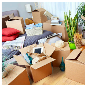
HELP CURTAIL CLUTTER