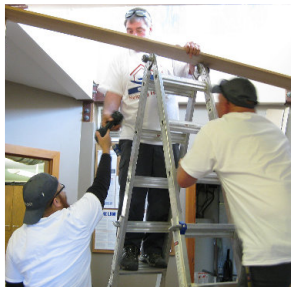
RECEPTION AREA TRIM REPLACEMENT