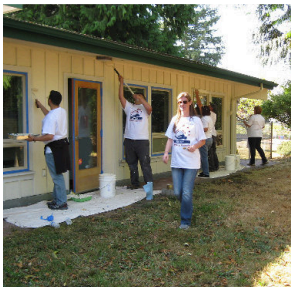
ADMINISTRATION BUILDING PAINTING

Some of the projects we tackled were: painting the administration building, repairing interior trim, building two picnic tables and benches, repair/repaint a memorial bridge. And, since it was their 60th birthday we helped them celebrate with cake!