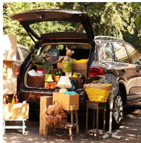
HELP CURTAIL CLUTTER