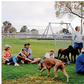
DON'T FORGET TO CLEAN UP AFTER FIDO