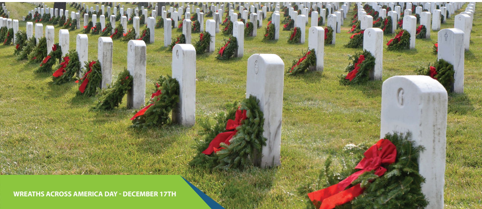
WREATHS ACROSS AMERICA DAY - DECEMBER 17TH

All streets are in high traffic priority levels.