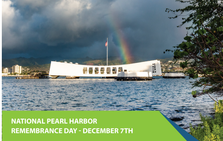
NATIONAL PEARL HARBOR REMEMBRANCE DAY - DECEMBER 7TH