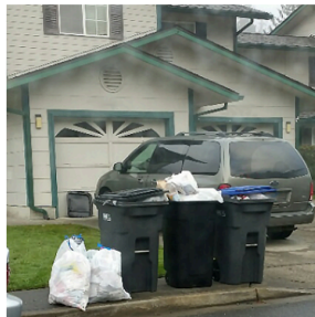
Avoid being charged for someone else's trash