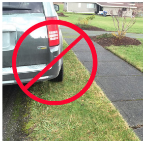
Be considerate of your neighbors: park right